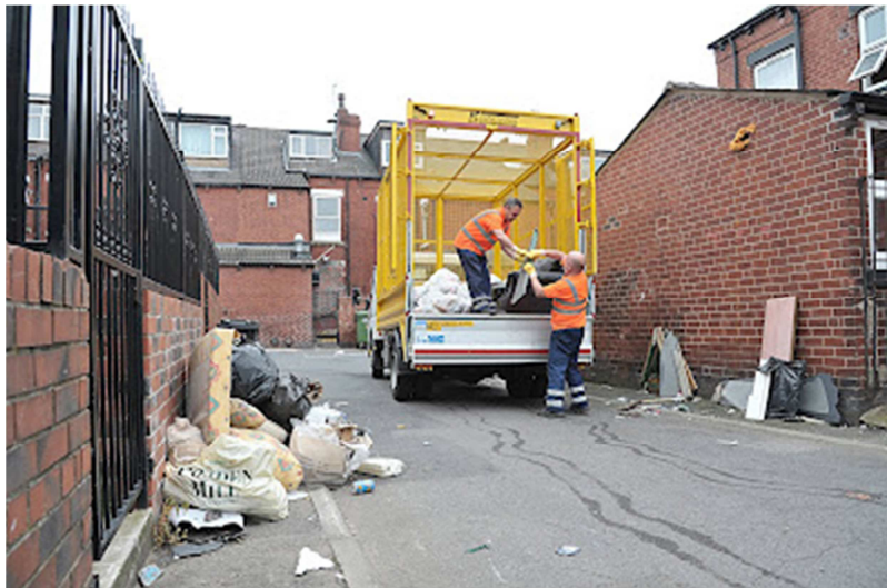
This is a back street in Beeston Hill.

Dewsbury Road is an area of special concern with a total of 31 late night takeaways operating from this busy area of Beeston. Not all the takeaways are licensed for the sale of hot food after 11pm and most are not controlled by conditions relating to litter nuisance. This has led to this area becoming of concern on the grounds of public nuisance caused by the amount of litter accumulations in the area.